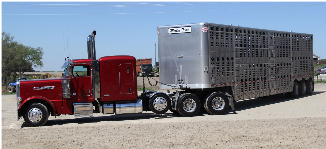
The livestock industry contributes to the economy in many ways, including keeping semis on the road.

Livestock development can also provide opportunities for young people to return to the farm, an opportunity they may not have had in a strictly row-crop operation.